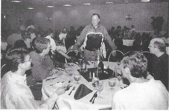
PASTA WORLD--The pasta feed at the host Marriott was bigger and better than ever, complete with unlimited Sutter Home wines.