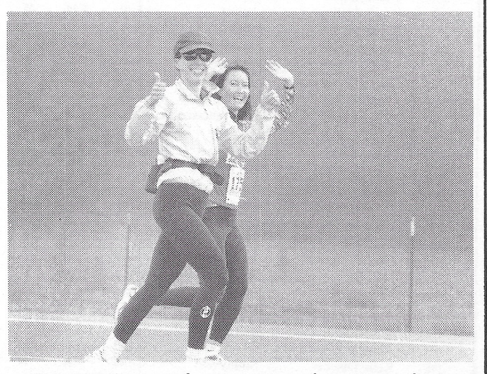
ALL SMILES--What's not to love? Cool air, rising sun, and a beautiful run through the Napa vineyards.